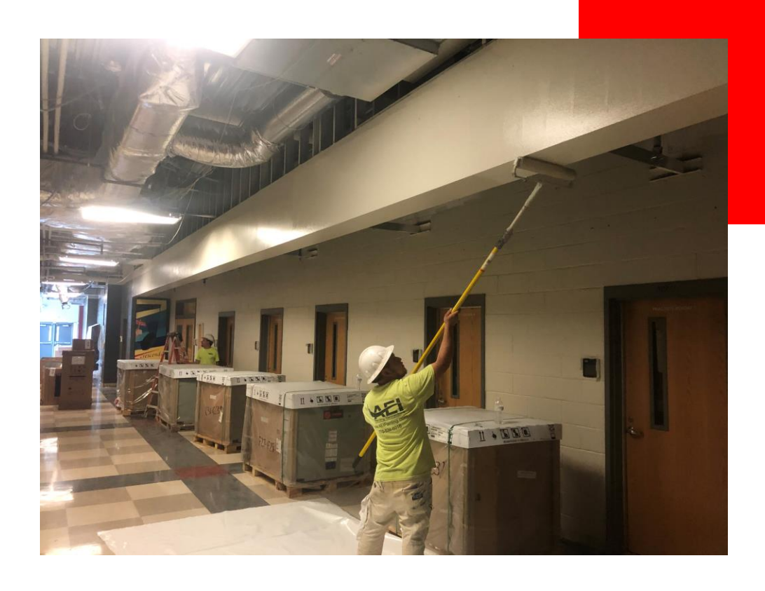
Painting in Theater Building