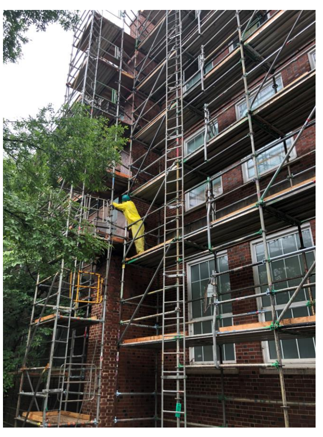
Cleaning for Masonry Restoration at Charles Allen Building